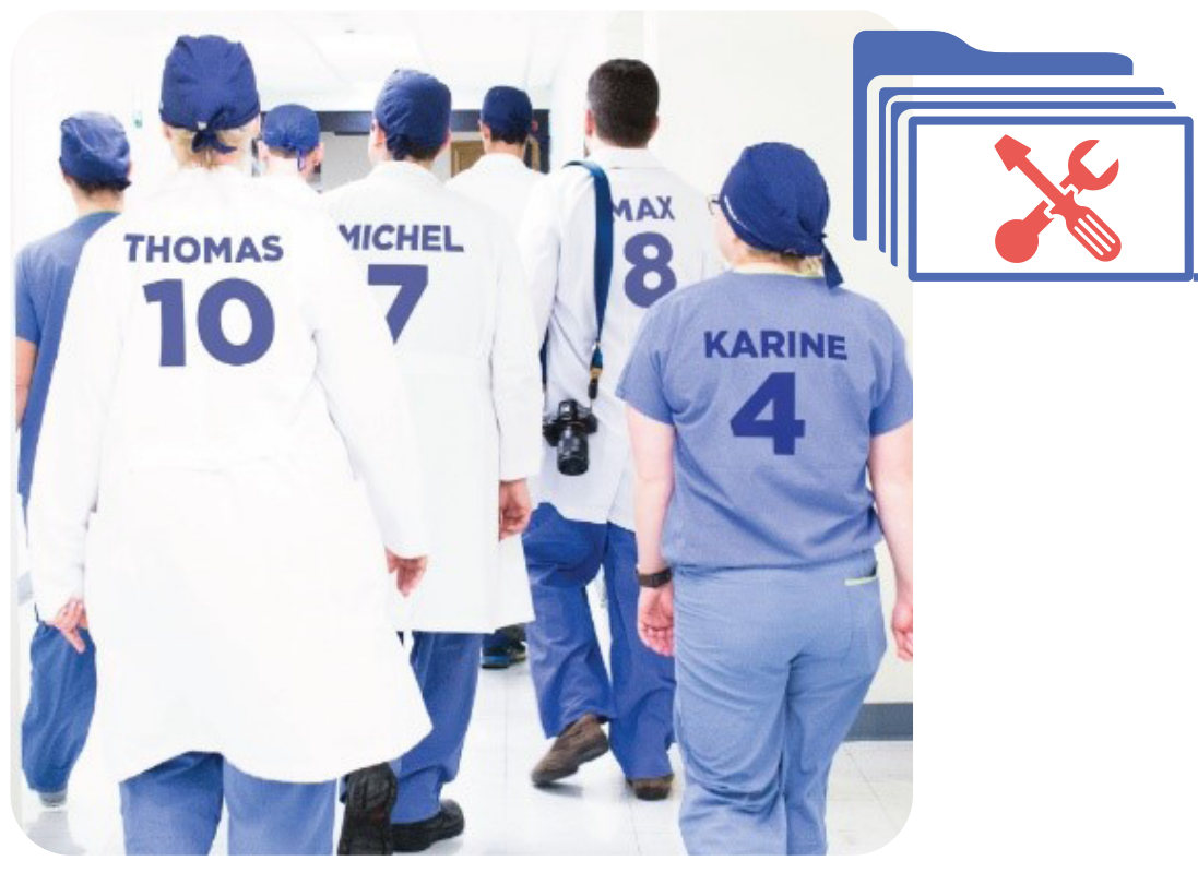
Visual of the campaign 1 patient 1 team carried out by CFAR : https://cfar.org/1patient1equipe